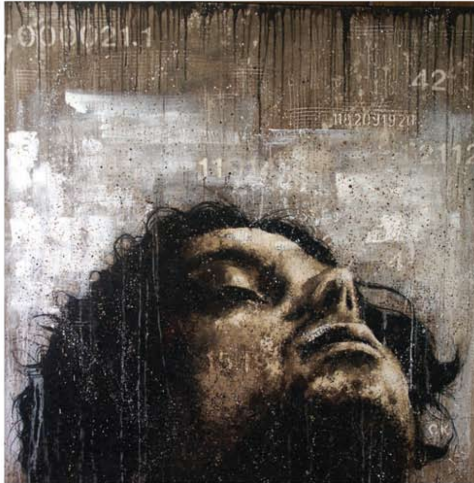
Emerge mixed media to include graphite, charcoal, acrylic, spray enamel and oil, 48 x 48 inches

My current work encompasses layer on layer of textures, and loose palettes designed to invite the viewer deep into the painting. I want to draw people in; then push them back. I currently utilize graphite, charcoal, sand, cement, spray enamel, acrylic, and oil to build up texture and emotion.