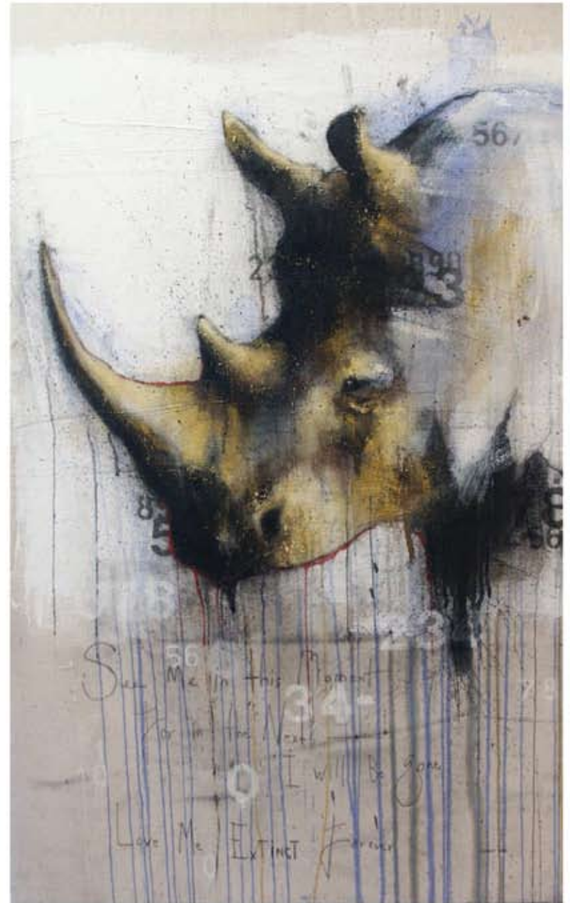
Extinct mixed media to include graphite, charcoal, acrylic, spray enamel and oil, 30 x 48 inches